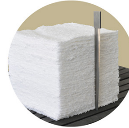
Excellent multilayer cutting quality...